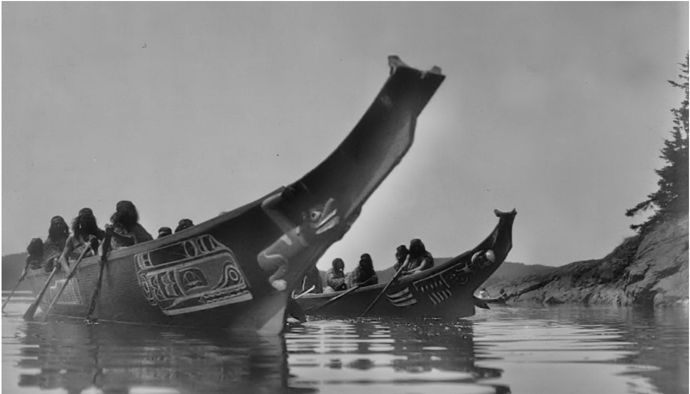
Fig. 2. Indian Dugout Canoes.