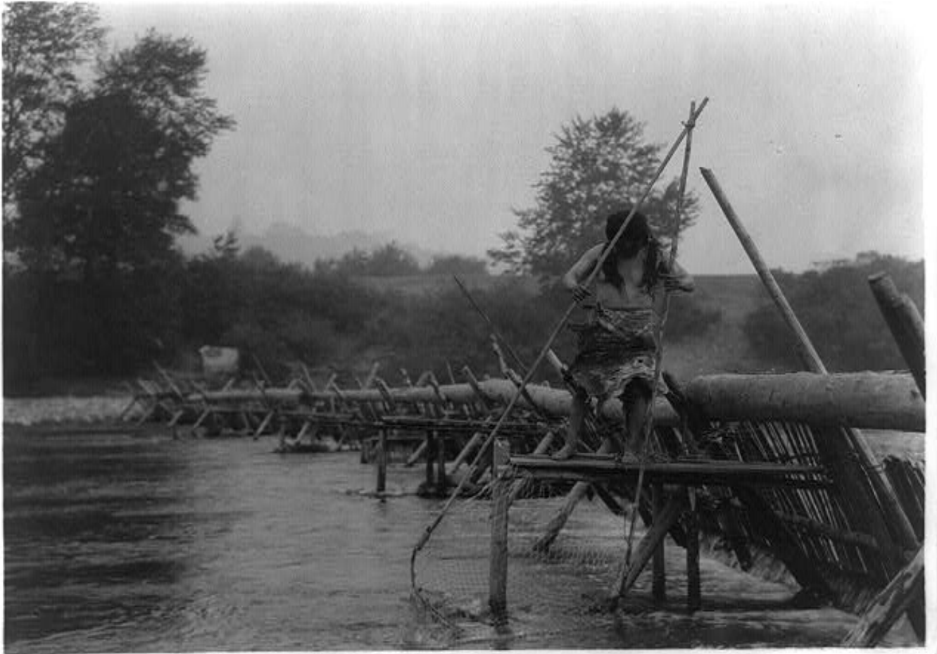
Fig. 3. Indian Fish Weir.

There must have been an offsetting benefit along the coast from resisting encroachment that was markedly lower or absent in the interior. Where information feedback was relatively clear, as along the coast, the informational benefits from excluding others was greater. Coastal tribes no doubt wanted rival tribes to leave their migrating salmon undisturbed for fear of clouding information feedback. In any event, managerial secrecy would have been of paramount importance. That coastal tribes were willing to incur the additional cost of harvest and transfer rather than allowing encroachment strongly supports the SHH.