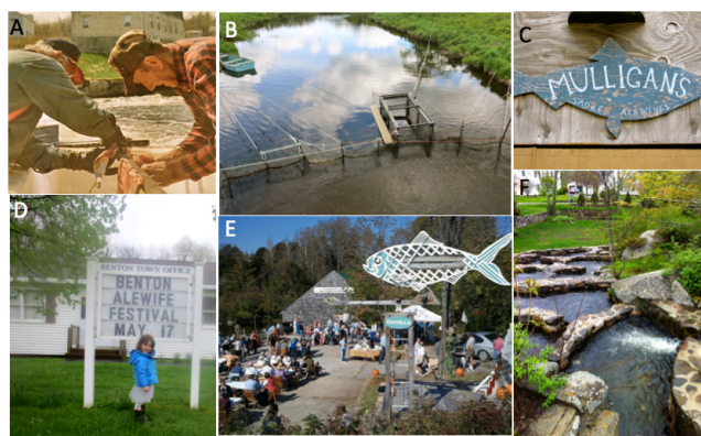
Fig. 2. A representation of various aspects of alewives ( Alosa pseudoharengus ) in Maine. (A) Two men smoking alewives in East Machias, Maine (ca. 1980). (B) A fish trap in Stueben, Maine, demonstrating the small scale of the alewife fishery. (C) A sign advertising smoked alewives in Damariscotta Mills, Maine. (D) A child attending the Benton alewife festival in 2014. (E) Participants of the Damariscotta Mills alewife festival. (F) A restored fishway in Damariscotta Mills.