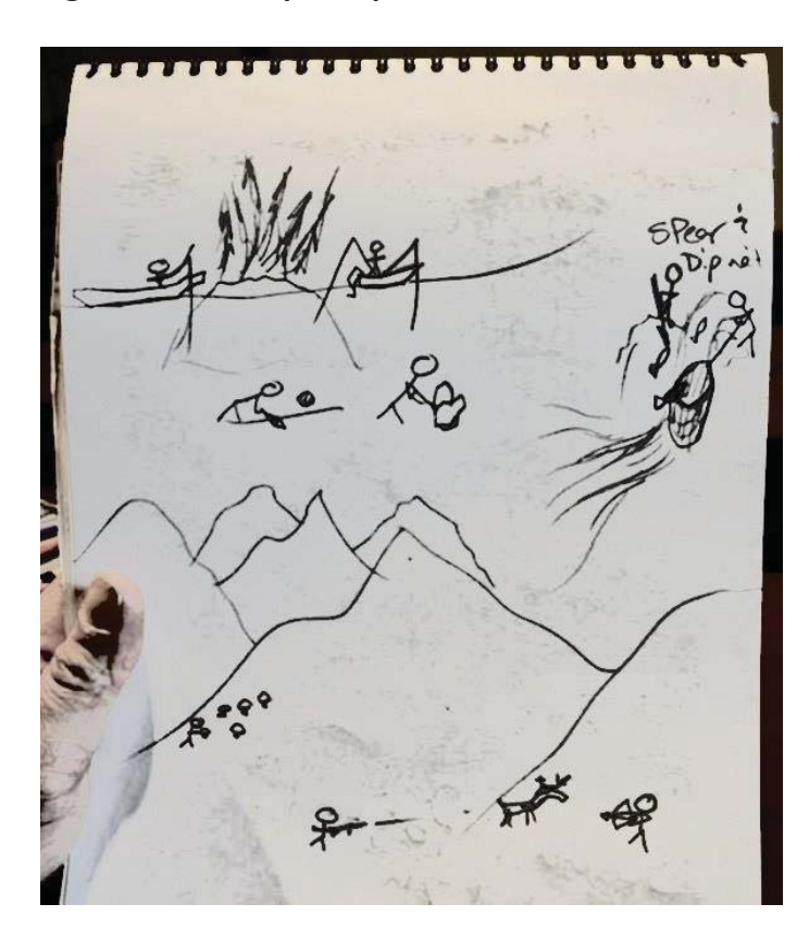
Figure A7.3: Sample depiction of local ambit: First Nations male

This image is an example of one First Nations male participant's response to the instruction "please depict the area in which you work and/or live." Note that this participant chose a series of outdoors scene, at a relatively high-resolution scale, depicting both land and water, with many humans in the image, each of which is conducting a different form of wild food collection. First Nations participants had, on average, over six (6.35) times higher odds of intuitively including humans in their depiction than did non-First Nations (p=0.028).