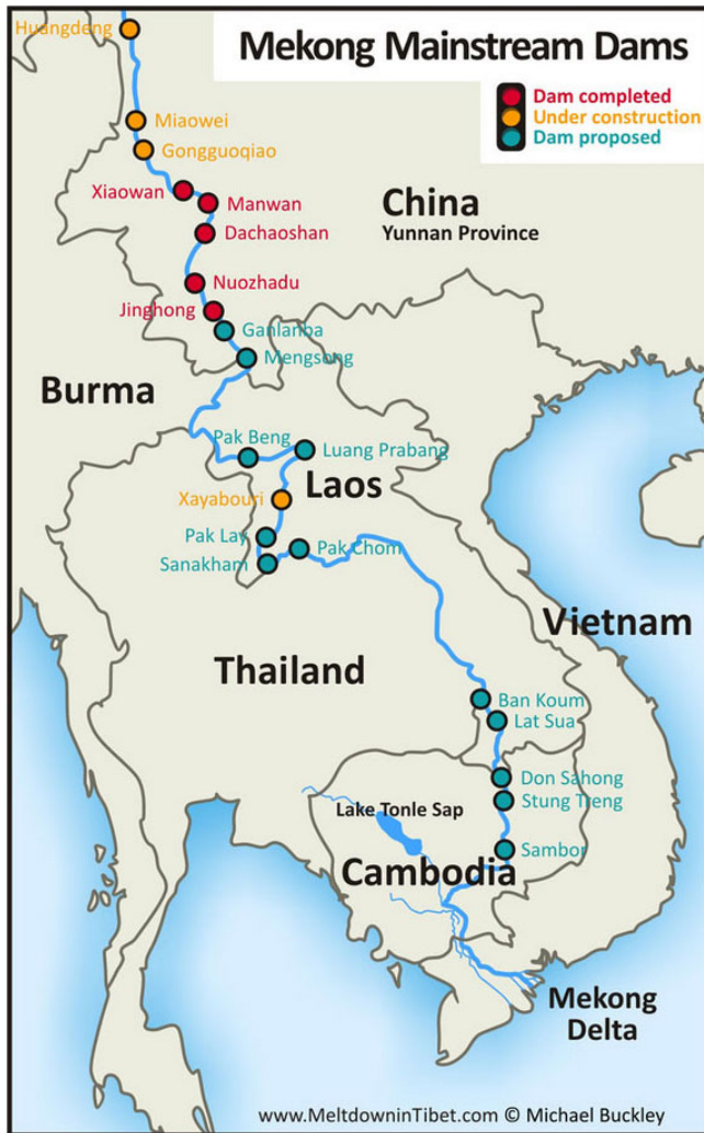
Fig. 1. Map showing the locations of mainstream dams in the Mekong basin as of 2014.

After identifying both analytical and data availability considerations, we agreed to focus on the group of riparian nations (actor group component), the MRA regime (governance system component), and water flow (environmental commons component). We focused on testing Ostrom’s design principles but were also open to evidence regarding the role of other variables. The SESMAD coding book was instrumental for that purpose because it includes clear operationalizations of the design principles, as well as of other variables from CPR theory and other theories.