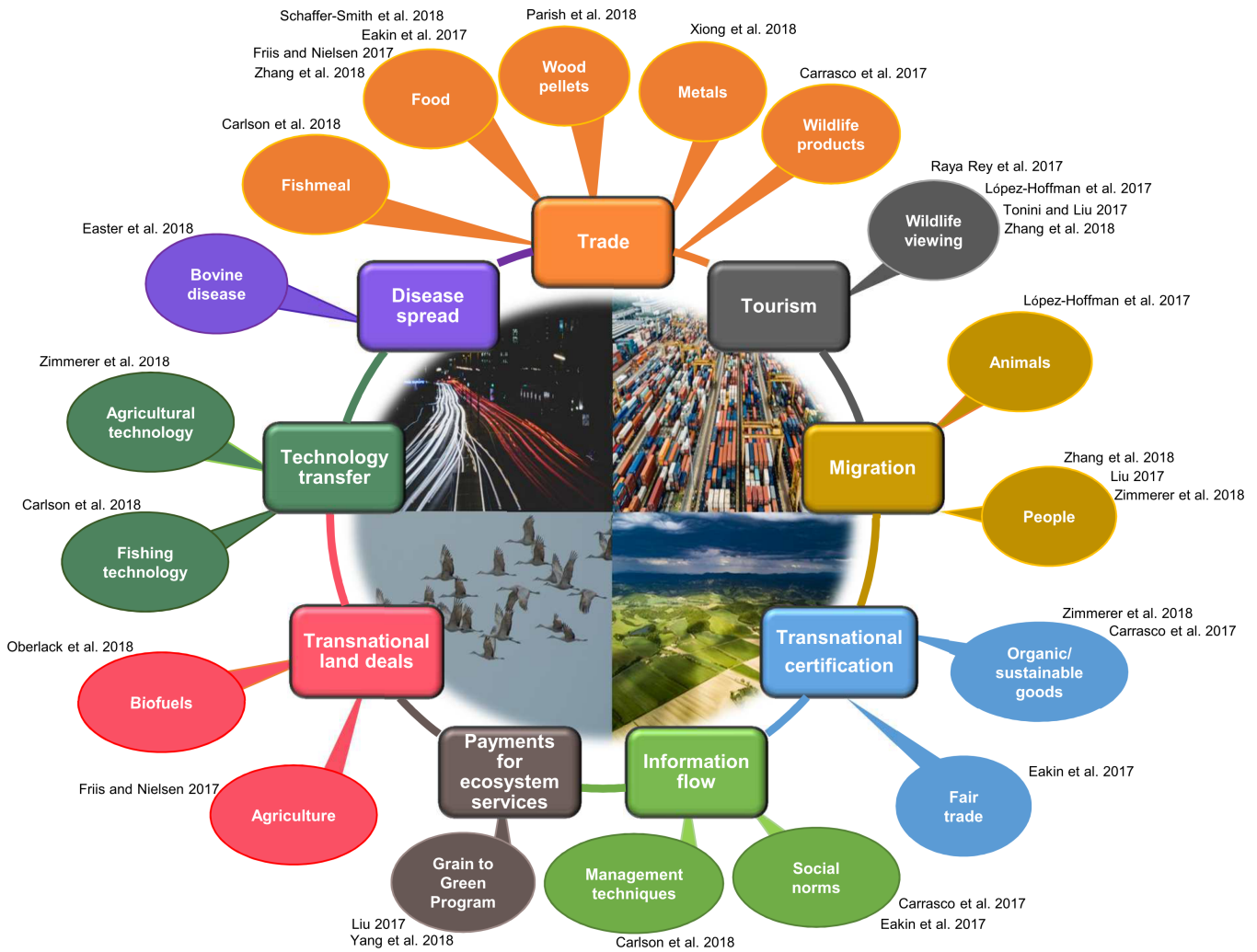
Fig. 1. Schematic illustrating the major telecouplings (on the circle) and associated examples (bubbles) explored in the special feature.

Hoffman et al. 2017), human migration (Carlson et al. 2018, Zhang et al. 2018), tourism (Raya Rey et al. 2017), payments for ecosystem services (Yang et al. 2018), transnational product certification schemes (Carrasco et al. 2017, Eakin et al. 2017), disease spread (Easter et al. 2018), transnational land grabbing (Oberlack et al. 2018), technology transfer (Zimmerer et al. 2018), and information spread (Carrasco et al. 2017, Carlson et al. 2018).