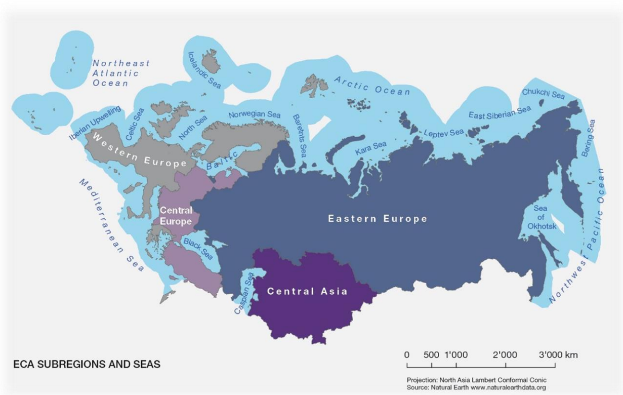
Figure A1.1: The four sub-regions of the IPBES Europe and Central Asia Regional Assessment.

Europe and Central Asia encompasses four sub-regions (see Figure A1.1) and 54 countries (see Table A1.1). According to Rounsevell et al. (2018) these countries vary greatly in size, including the largest and smallest on Earth, have diverse geography and history, but also common properties in terms of geography and climate, history and social systems. The region shares many cultural norms and historical features reflected in some similarities in land use, environmental history, biodiversity and ecosystem services. Nevertheless, the region encompasses high heterogeneity in natural and socio-cultural aspects. The seas that surround the region are also very heterogeneous in terms of temperatures, currents, nutrient availability, depths and mixing regimes.