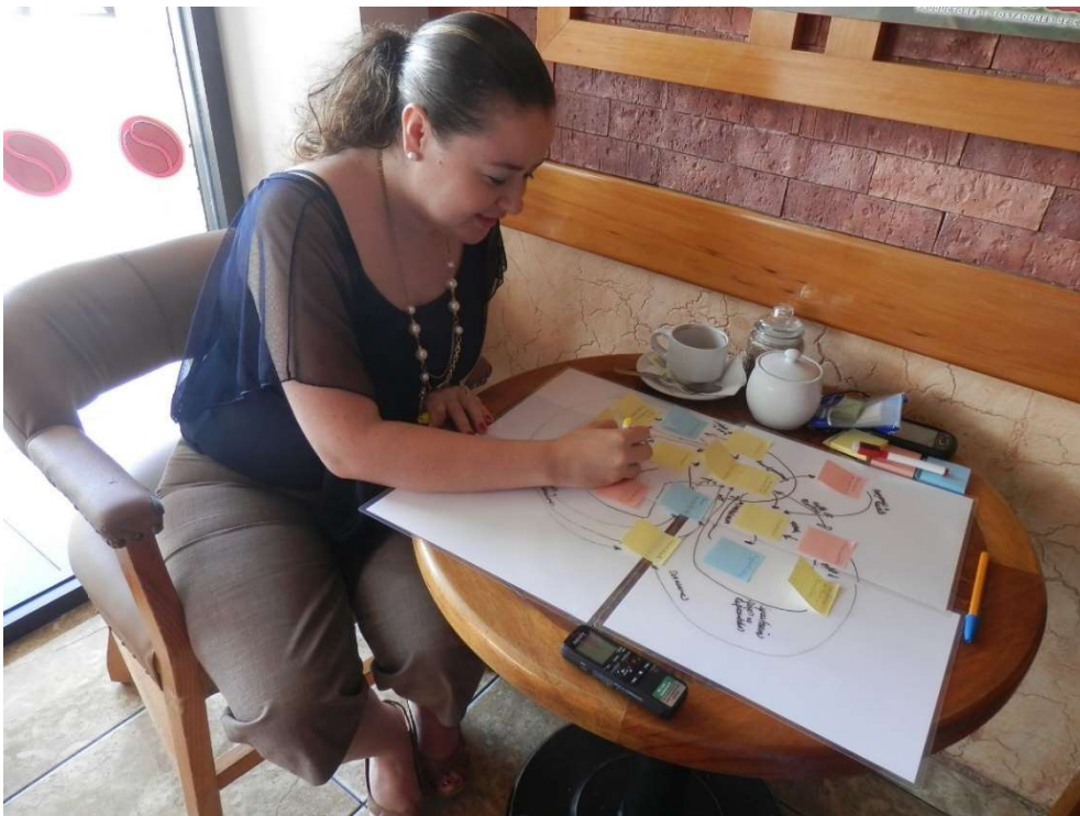
Fig. A1.1. Mental model drawing by A) a leader of a fishing cooperative, and B) a representative of an NGO.