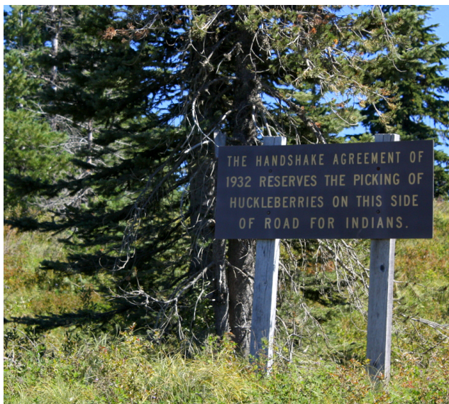
Fig. 4. A sign marks the boundary of an exclusive gathering area set aside decades ago under the “Handshake Agreement” in a part of the Indian Heaven Wilderness, Gifford Pinchot National Forest, Washington, USA.

Managing roads is important because they provide access to both tribal practitioners and nontribal recreational users who could impact tribal resources. Because roads help tribal elders to access traditional harvesting areas, they are important for facilitating the sharing of traditional knowledge with younger generations (Dobkins et al. 2016). Establishment of some tribal stewardship areas has explicitly included reopening roads to key gathering sites (LeCompte-Mastenbrook 2016).