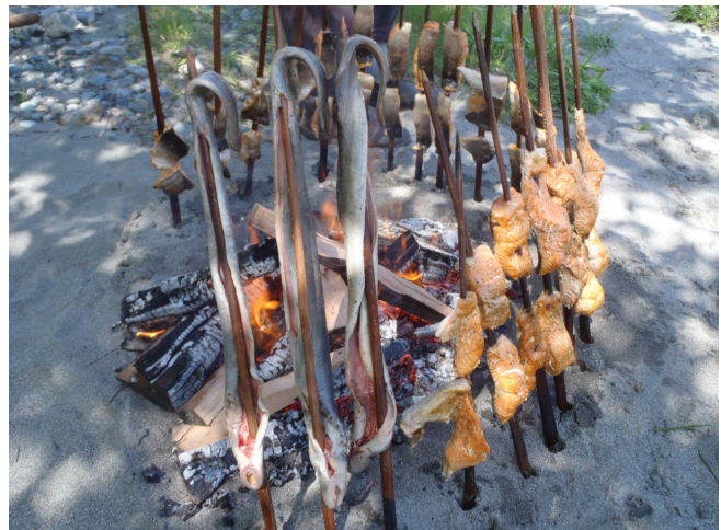
Fig. 3. A traditional tribal meal demonstrates an array of ecocultural resources, including lamprey and salmon prepared on coast redwood and western redcedar sticks over a madrone wood fire along the Salmon River, California, USA. April 2016.

The NWFP monitoring reports note that some tribal respondents regard the NWFP as having improved the condition of terrestrial and aquatic ecosystems by providing protection for old-growth forest and aquatic habitats (Vinyeta and Lynn 2015). However, these reports and research conducted with tribes (LeCompte-Mastenbrook 2016) also describe how fire suppression and minimal disturbance approaches, especially within designated wilderness areas and late-successional reserves created by the NWFP, have inhibited availability of important resources such as huckleberries and elk. Fire suppression has reduced the occurrence of both high-severity, stand-replacing fire, especially in moist forests, as well as low-severity fires, especially in dry forests (Miller et al. 2012, Reilly et al. 2017). These changes in fire