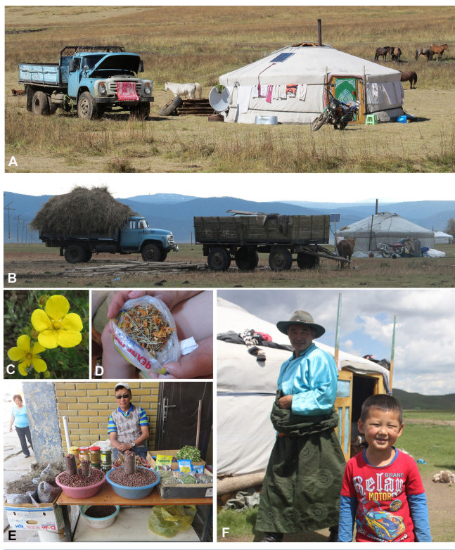
Fig. 3. Examples of biocultural diversity and change in the Mongolian pastoralist context (Seele 2017). Although the ger and homestead remain at the center of pastoralist life, pivotal changes in material culture, the mobility of livestock, and knowledge exchange reflect the interplay between changes in biodiversity at multiple scales and changes in the cultural uses of the environment. (A) The shift from horses to trucks and motorbikes has stimulated biocultural change; (B) A decrease in nomadic mobility and pasture rotation can mean having to bring in fodder by truck, and (C) fewer opportunities for harvesting fresh medicinal plants in different areas. As a result, (D) the storage of medicinal plants in plastic bags is now common and (E) herbal medicines can also be bought in larger settlements; (F) Although changes in dress between generations is clear, the effects of changes in intergenerational knowledge transfer are less so.

biological and cultural diversity thus contribute significantly to the resilience of social-ecological systems (Persic and Martin 2008).