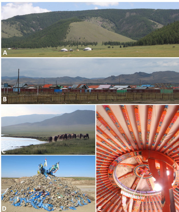
Fig. 1. Continuity and change in the Mongolian pastoralist context: Culturally significant sites at different spatial scales (from the landscape level to the microscale within people's homes [ gers ]) reflecting biocultural change. (A) the location of the ger homestead is carefully chosen according to livestock needs and cultural significance; (B) changes to a more sedentary lifestyle can affect cultural traditions, for example, limiting access to culturally significant sites; (C) certain landscape features, such as lakes, hold both cultural and livelihood significance; (D) an ovoo (rock cairn) signifies a landmark of cultural value; traditionally shrines are also built in more remote locations of ritual or mythical value, such as secret valleys and forests, but are not shown here because of cultural sensitivities; and (E) the inner ger architecture and arrangement holds cultural significance.

Preliminary field work was done in the autumn of 2014 to establish research contacts and to pretest methods. This was followed by an intensive field study in the north-central part of Mongolia during the summer and autumn of 2015. Data for the field study were collected using a mixed methods approach that included participant observation, semistructured interviews with open- and closed-ended questions, as well as personal observations and reflections recorded on detailed observation schedules. Insights were also acquired through informal discussions, journeying on horseback, and staying with herder families.