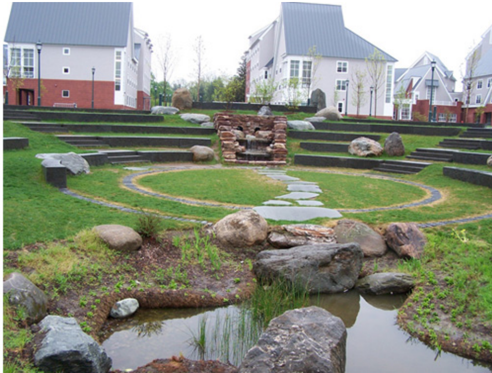
Figure 5. Multifunctional stormwater treatment feature in the residential dormitory green space at the University of Vermont.