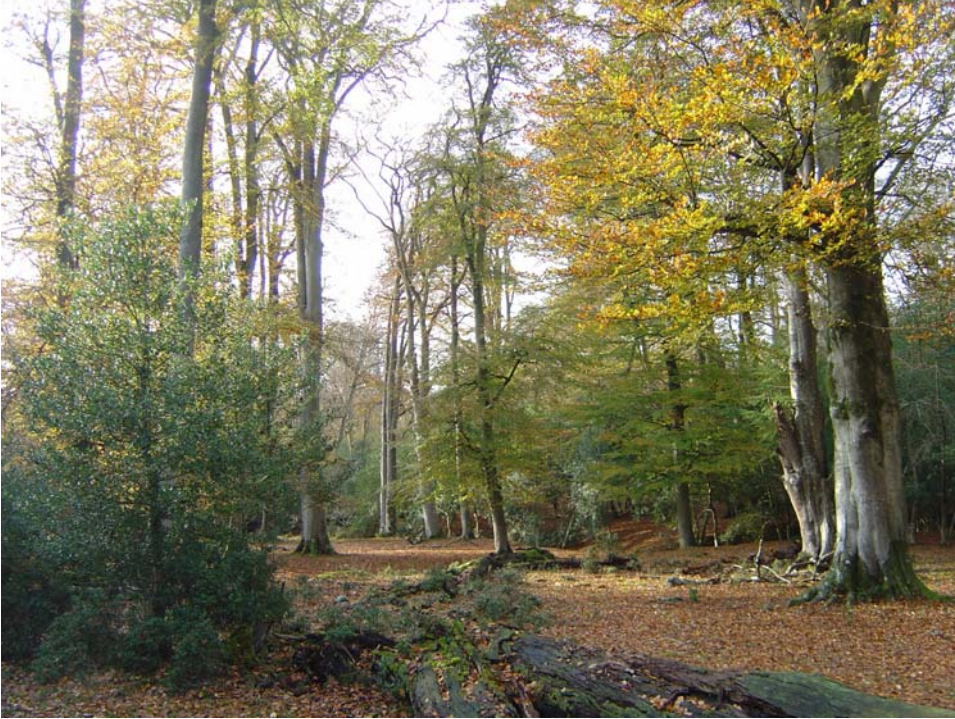
Figure A3.4. Wood Crates, one of the ancient woodlands of the New Forest, of exceptional value as habitat for wildlife.