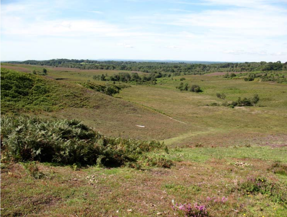
Figure A3.2. Landscape of the New Forest illustrating a typical mosaic of heathland, grassland and woodland communities.