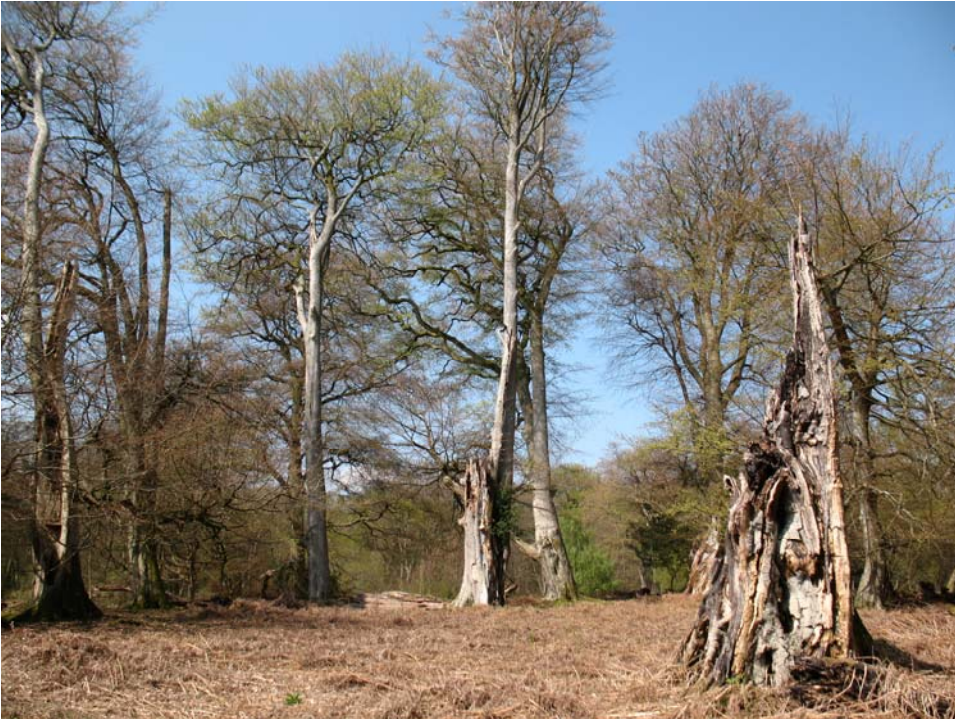
Figure A3.5. Mark Ash wood, illustrating the canopy collapse that has occurred in some New Forest beechwoods, supporting elements of Vera's theory.