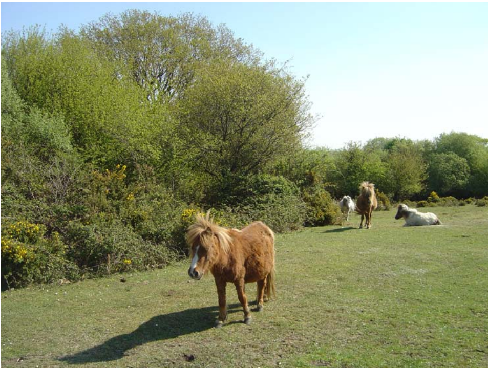
Figure A3.3. Interface between scrub and grassland communities, with New Forest ponies. Tree establishment is visible within the thorny scrub, in accordance with Vera's theory.