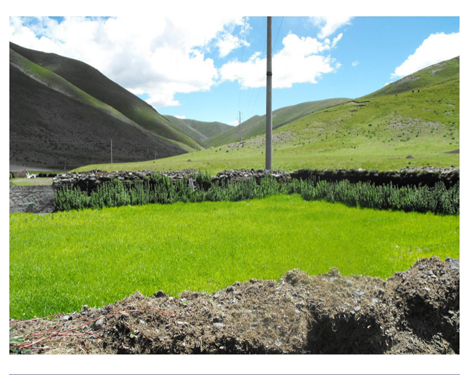
Fig. 2. Planting forage grass to maintain forage supply.

In addition, to join the formal pastoral cooperatives, other market-oriented adaptation strategies, such as buying fodder and planting forage grasses are also becoming increasingly important. According to the survey, almost all the households (126 households) purchased fodder, most commonly barley straw, in 2010 (Table 6). Households spent approximately 1500 RMB on average, which was nearly half of their expenditure on livestock production. As a result of irreversible effects of pasture degradation, most herders are expected to purchase more fodder in the coming years. This situation would undoubtedly increase their dependence on the external market. Table 6 shows that a total of 117 households bought grass seedlings with an average cost of 326 RMB per household, which they could plant near their settlements. They generally agreed that planting forage grass could increase forage reserves and prepare them for extreme weather events, such as snowstorms. However, the high requirements for water, soil, and technological conditions limit large-scale cultivation.