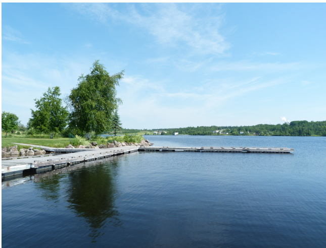
Fig. 3. Mactaquac headpond, viewed from the town of Nackawic.

At the time of study, New Brunswick Power (NB Power), who owns the dam, was in the process of evaluating options for the dam's end of life, which was moved forward because of a structural problem. The three options under consideration were: to rebuild the affected concrete electricity generating structures, which would allow the dam to continue functioning as a hydropower producer and maintain the headpond; to retain the earthen dam that maintains the headpond and decommission the electricity generating structures; and to remove the dam entirely and return the river to its free-flowing state (NB Power 2016). At the time of data collection, the environmental and social impacts of each of these options had been reviewed and communicated