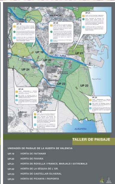
Images of the boards that were used to inform participants about the location and characteristics of landscape character areas.