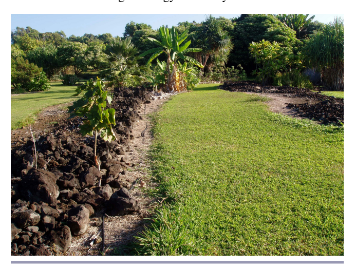
Fig. 4. The archaeological remains of a lithic berm ( kuaiwi ) in Kealakekua, Kona Hema, Hawai'i. Such lithic berms were constructed to increase ecosystem services (e.g., moisture retention) and decrease ecosystem disservices (e.g., erosion) in intensified rain-fed agroecology.

An example of habitat augmentation in aquatic systems is the construction of fish houses (imu or ahu) in shallow nearshore areas (Maly and Maly 2003b. Kahaulelio and Pukui 2006), which added structural complexity in nearshore environments and essentially equated to miniature artificial reefs along the coastline. Hawaiian nearshore habitats are characterized by high wave energy and low habitat complexity relative to other locations throughout the Pacific (Bird et al. 2013, Franklin et al. 2013). Therefore, the habitat complexity with high rugosity (created by large areas of coral reefs) that does exist is an important driver of coral reef biodiversity and abundance (Friedlander and Parrish 1998, Rodgers et al. 2010). Imulahu construction thereby mimicked the structurally complex coral reef to create habitats for cryptic species and safe-zone habitats for juvenile fishes (Madin et al. 2019), all of which are necessary for healthy ecosystem functioning. Fish houses were typically constructed