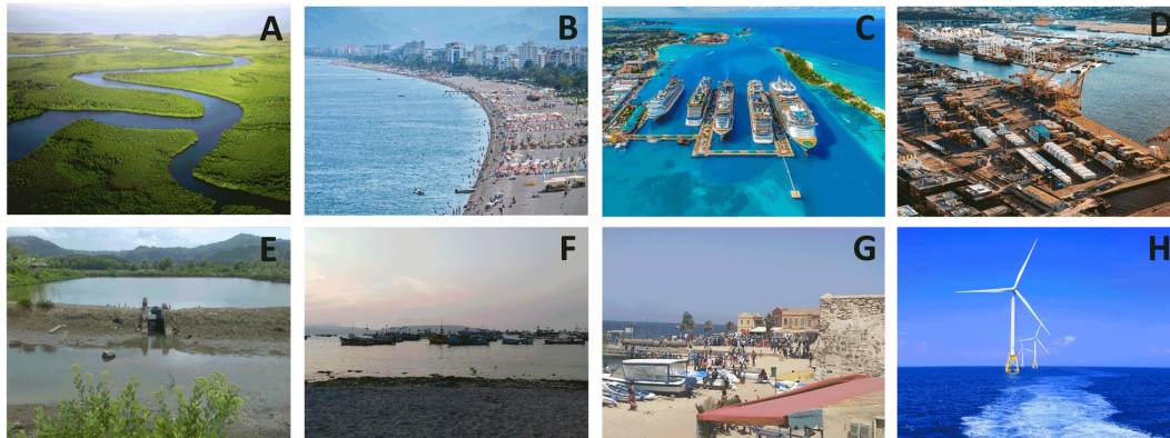
Fig. 1. Diverse coastal systems and uses. (A) A large wetland and river on the coast of The Gambia. (B) A coastal beach populated by tourists in Turkey. (C) Large port development for tourism in the Caribbean. (D) Port development for industry and trade in Japan. (E) Wetland pond aquaculture system in an Indonesian mangrove forest with water supplied by tidal flows. (F) Small-scale fishing boats off the coast of Peru. (G) A Senegalese fishing village. (H) Offshore wind energy in the United States.

environmental governance is a diverse body of scholarship, the theories reviewed are applicable across sectors and thematic areas. To focus our synthesis empirically, and to provide a coherent set of examples to relationally orient each theory, we concentrate on coastal systems as a representative field with limited integration of governance activities and perspectives across a diversity of stakeholders, sectors, and land-sea interactions, while also being among the most impacted and exploited natural resource systems worldwide (Olsen 2003, Lebel 2012, Van Assche et al. 2020a). The coastal context outlined below provides us with a set of empirical examples with which to compare the analytical capabilities and applicability of each theory. However, the theories summarized are not limited to coastal application. We believe this article can be useful for any environmental governance scholar navigating the literature and seeking a synthetic overview with questions about the analytical usefulness of each theory and the relationships between theories.