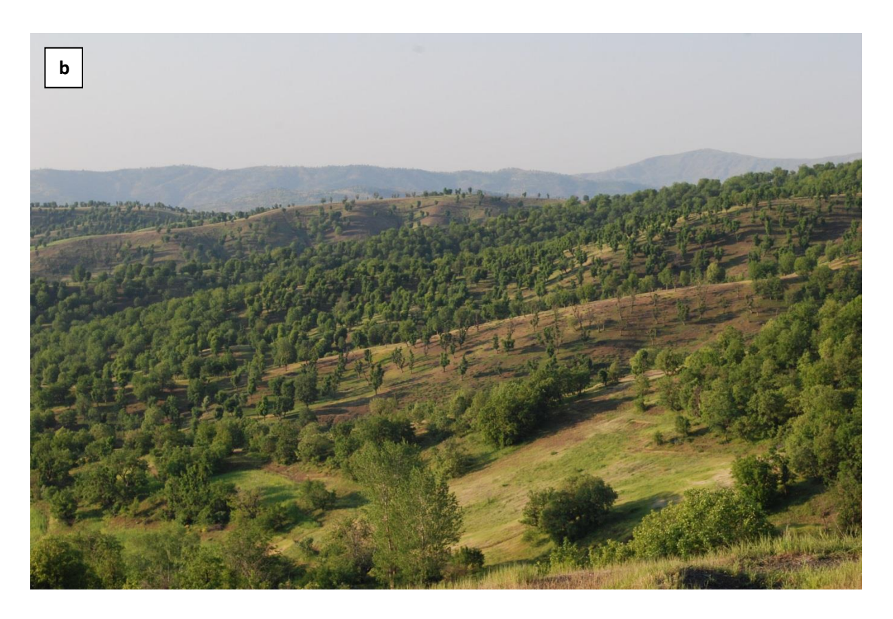
Figure A1.1: (a) A sacred grove surrounded by traditional farmland and woodland and (b) Silvopastoral woodland of traditionally pollarded oaks.