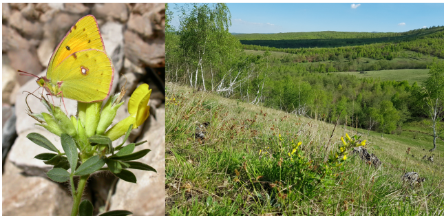
Fig. 2. Colias myrmidone female on its host plant Chamaecytisus sp. (left); and its typical habitat in Transylvania (right).

the observations were close to forest patches (<500 m, unpublished data ). The mosaic landscapes in which we observed the butterfly are characterized by high spatial and land-use heterogeneity (Loos et al. 2020) and are often transitioning ecosystems between forests and grasslands, often lightly grazed by free-roaming animals. This structural complexity provides shelter for the butterfly from grazing pressure, wind, and sun exposure. Moreover, the presence of structures across the wider landscape may be an important element for species dispersal. Based on preliminary investigations by a mark–recapture study in 2018 and 2019 ( unpublished data ), the mobility pattern of this species may be more complex than previously thought: despite being a strong flyer, C. myrmidone populations appear to remain rather localized, which may require good connectivity of its habitat patches for its dispersal. In our target areas, we observed ongoing threats through overgrazing but also through shrub and tree encroachment through land abandonment and afforestation. Out of 1894 observations between the years 2011 and 2019, 98% of our C. myrmidone observations were on areas that are estimated to be HNV farmland (Paracchini et al. 2008).