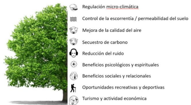
Fig 5.2 – Ecosystem Services categories presented in the workshop