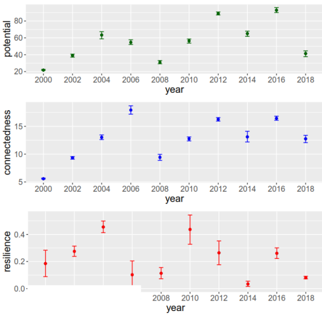
(b) noise level 1e-20