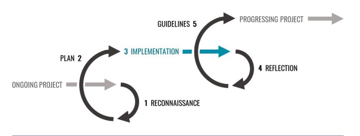
Fig. 1. Cyclical protocol of the research: exploring the context (reconnaissance), planning future activities, implementing the plan, reflecting upon the results, and refining the plan.

Each particular PAR project is designed using selected qualitative or quantitative research methods to fit a particular object of inquiry (Pain 2003, Koshy 2005, McIntyre 2008). Here, the research met the requirement of data triangulation by combining desk-research (media coverage and documents), interviews (personal testimonies from direct participants)<sup>[1]</sup>, and first-hand observations by the author, who was actively involved in the process. The scope in which particular methods were employed varied across stages: