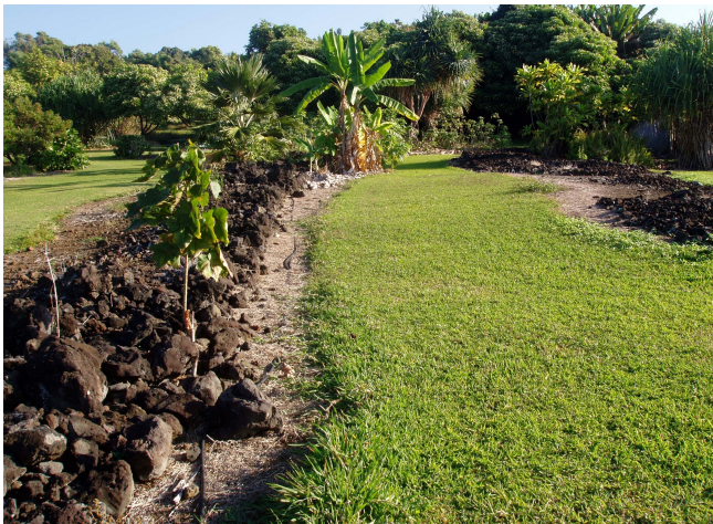
Fig. 4. The archaeological remains of a lithic berm ( kuaiwi ) in Kealakekua, Kona Hema, Hawai'i. Such lithic berms were constructed to increase ecosystem services (e.g., moisture retention) and decrease ecosystem disservices (e.g., erosion) in intensified rain-fed agroecology.

An example of habitat augmentation in aquatic systems is the construction of fish houses ( imu or ahu ) in shallow nearshore areas (Maly and Maly 2003b, Kahaulelio and Pukui 2006), which added structural complexity in nearshore environments and essentially equated to miniature artificial reefs along the coastline. Hawaiian nearshore habitats are characterized by high wave energy and low habitat complexity relative to other locations throughout the Pacific (Bird et al. 2013, Franklin et al. 2013). Therefore, the habitat complexity with high rugosity (created by large areas of coral reefs) that does exist is an important driver of coral reef biodiversity and abundance (Friedlander and Parrish 1998, Rodgers et al. 2010). Imulahu construction thereby mimicked the structurally complex coral reef to create habitats for cryptic species and safe-zone habitats for juvenile fishes (Madin et al. 2019), all of which are necessary for healthy ecosystem functioning. Fish houses were typically constructed