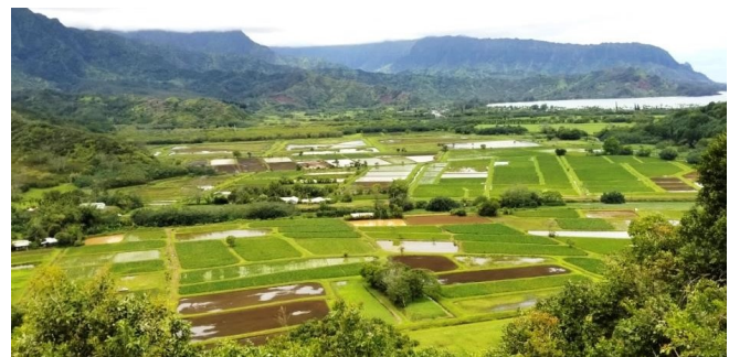
Fig. 3. A 2019 photograph of the heterogeneous landscape created by a wetland agroecosystem in the ahupua‘a of Hanalei on Kaua‘i Island.

complex carbohydrates while expanding habitat for native species that were also important resources. It subsequently provided increases in food abundance and food security while retaining water and sediment. However, as with other forms of intensified agriculture, proper management was needed to avoid detrimental increases in nutrient loads downstream and in the estuary (Bremer et al. 2018). This potential ecosystem disservice actually created an opportunity to design and develop other forms of ecomimicry as mitigation measures downstream (e.g., aquaculture ponds, see Forms of ecomimicry integrated into Hawaiian social-ecological systems: Trophic engineering ).