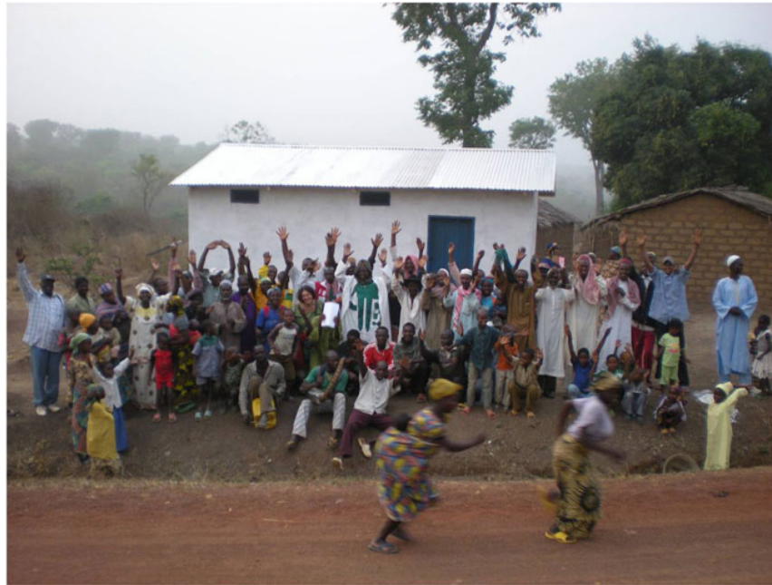
Fig. 5. Guiding the hope of beefarmers in Ngoundal. Collection center inauguration with village suppliers, March 2009

and Society for initiating a “Practitioners Award” and thank the Editor and Subject Editor for their constructive review comments.