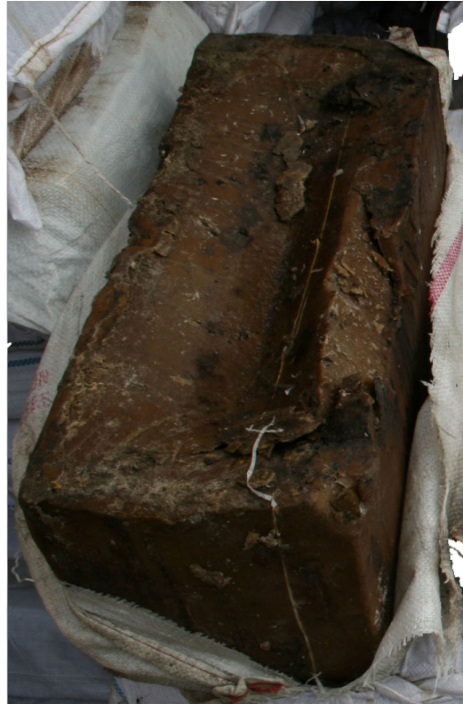
Fig. 2. Smoky black wax

beekeepers are affiliated in 32 villages around Ngaoundal, with three cooperatives being “preferred suppliers” in the Northwest. To date, over 100 tons of wax and about 20 tons of honey have been exported and twice that amount is sold locally in Cameroon, at prices up to 50% higher than normal market prices for the Ngaoundal beekeepers. Propolis is now being bought at a price double that for a kilo of honey, with first year orders for over 100 kg from Europe and the USA. It used to be thrown away. The beekeeping families are now experimenting more and producing apiculture-based products such as candles, soaps, creams, and honey wines (Fig. 4). Yves and Verina’s scientific backgrounds are again being used as they research product recipes and advise on marketing and business development models to see what products can be used and adapted locally to initiate new value chains. Examples of the increases in beekeeper incomes are now apparent in the communities; they range from purchasing a zinc roof for the house, to a motorbike to take products to market, more children are going to school, and women can afford