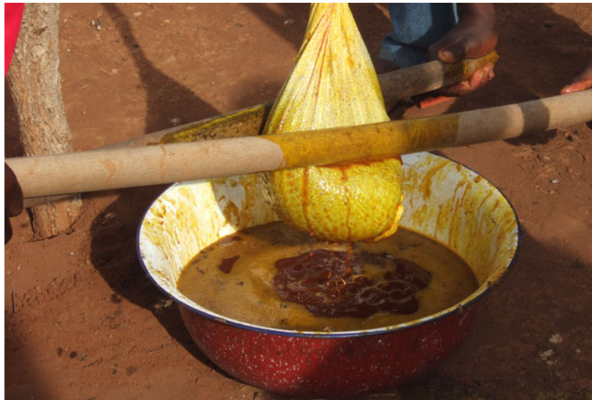
Fig. 3. Yellow wax

beekeeping is traditionally done by individuals or families and not as a collective activity, on average 68% of households in Djerem are involved in beekeeping. For 55% of these families it is their primary income source, providing up to 48% of total household income. Seasonal botanic variations allow for two harvests in some years and wide flowering variations in alternating years, leading to highs and lows of production in the savannah and mountain forests annually. Weather changes also strongly influence the quality and quantity of production, resulting in extremely variable incomes. A second survey is planned for 2011 to assess and monitor the socioeconomic impact in detail and see through the natural trends to assess the effect on livelihoods of Guiding Hope's actions.