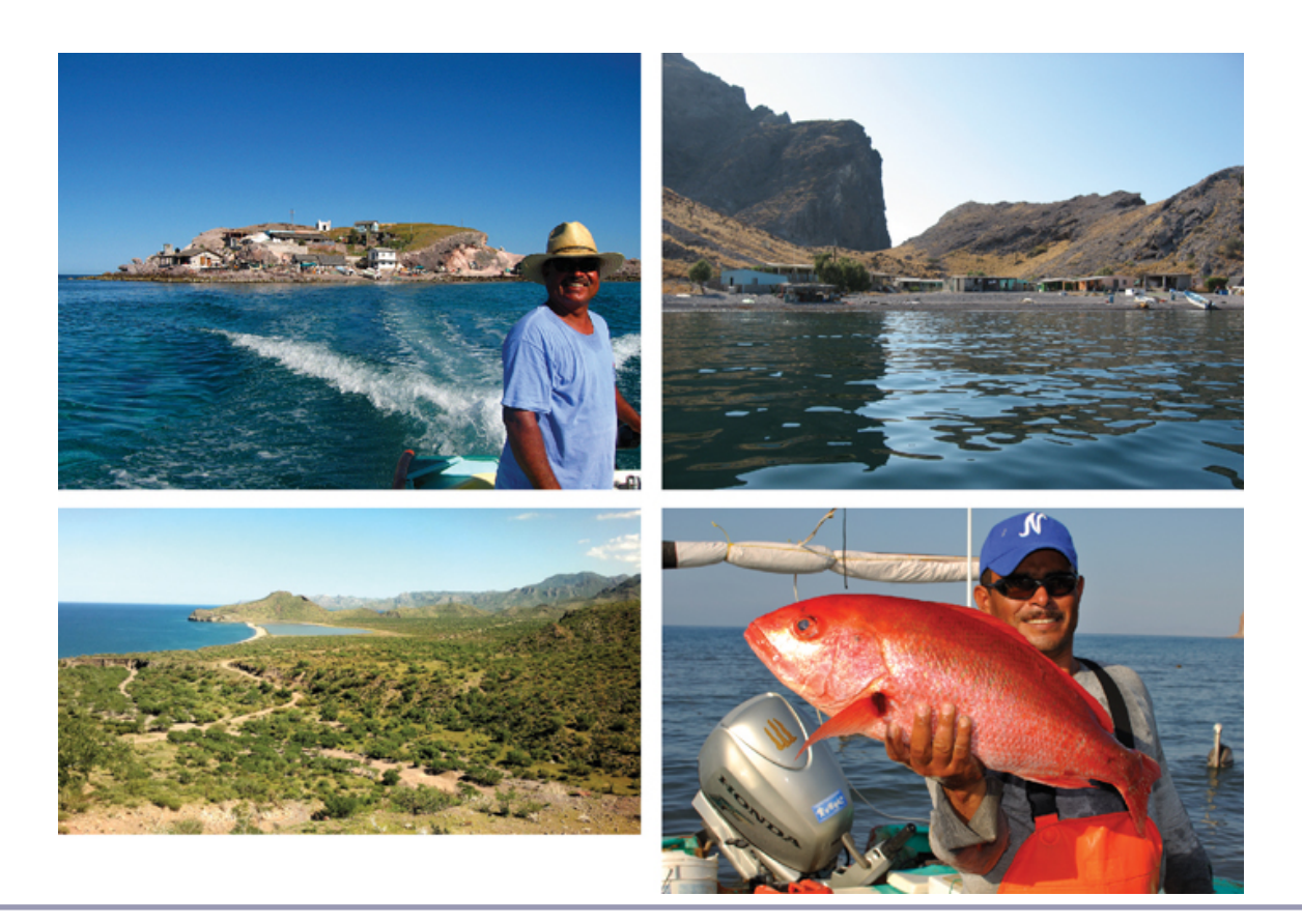
Fig. 2 . Social-ecological characteristics of the study area. Clockwise: (a) Community of El Pardito. (b) Community of Punta Alta. (c) Huachinango (red snapper Lutjanus peru ). (d) Only two roads are passable year-round.

success of patron-client relations (Wang 1999) and co-ops (Poggie et al. 1988).