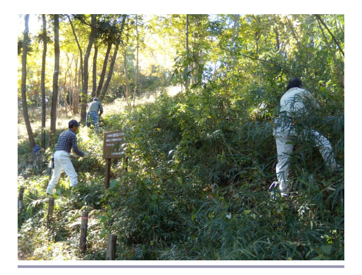
Fig. 2. Example of community group activity at peri-urban satoyama woodland.

Ecological knowledge in satoyama woodland management includes the choice of trees and grasses to be removed, how to use woody products for charcoal and fertilizers, and how to use mechanical equipment for management activities (Kameyama 1996). Contemporary ecological knowledge differs slightly from the traditional, as public demands relating to satoyama management have changed from needing natural resources, to needing places for nature conservation and recreation (Takeuchi