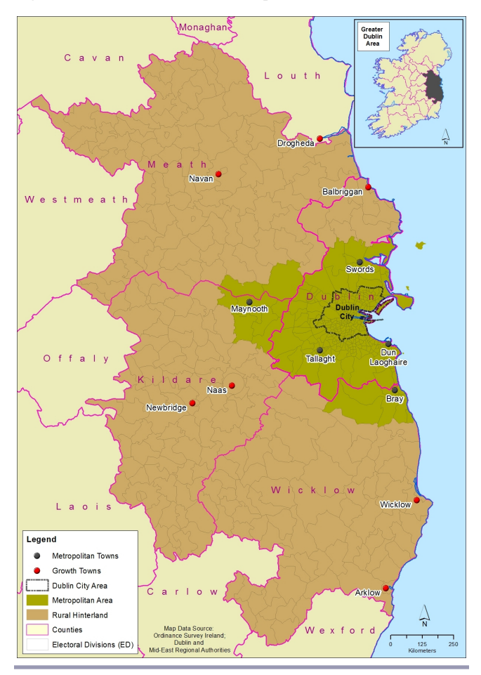
Fig. 3. Greater Dublin Area: metropolitan and hinterland areas.

Given the sustained growth in the size of the economy until the demise of the "Celtic Tiger" period in 2008 and thereafter, and the associated growth in population and employment, the regional imbalance between population and access to water resources has reached a tipping point with demand for treated water in the Dublin Region WSA, that includes parts of the Mid-East counties, currently exceeding the sustainable production capacity of the existing major water treatment plants (Dublin City Council 2010b). Notwithstanding the current economic downturn of the last five years that has resulted in what are considered to be short-term reduced water demand growth rates, Dublin City Council (2010b) has recognized that if not addressed, water shortages are likely to become more common and that for the horizon to 2040, supply levels will need to increase from the current value of 550 million liters/day to 800 million liters/day. This projected deficit is based on the most likely planning and climate change scenario.