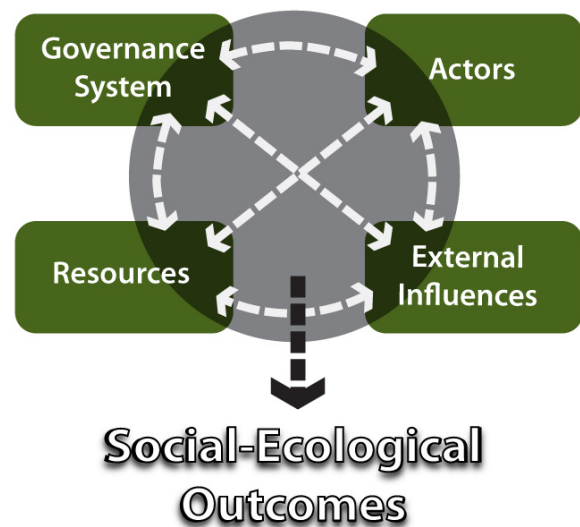
Fig. 2. A general framework for analyzing social-ecological systems.

Responses to this article can be read online at: