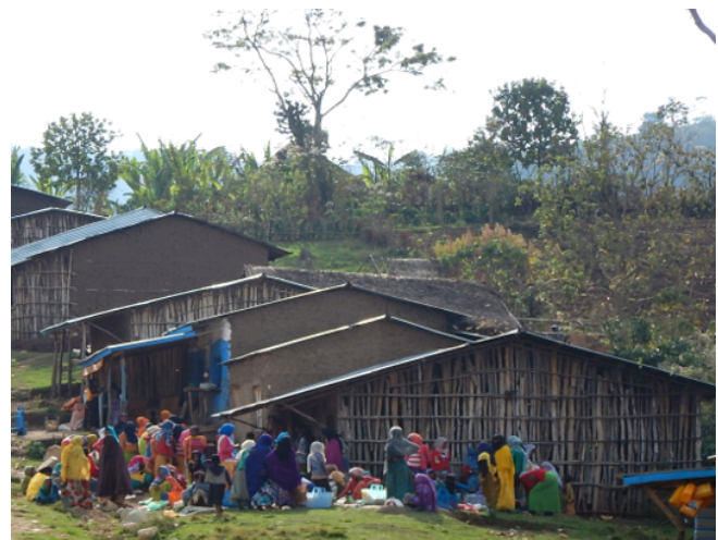
Fig. 2. Women in a community market.

undertaken. Most households engage in diversified livelihoods that combine crop production with other income-generating activities. However, the production of diverse crops is the most common and is considered to be the most important livelihood by local residents. The majority of the population belong to the Oromo ethnic group and are Muslims (Manlosa et al. 2019a).